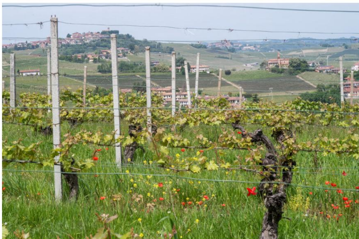
Looking towards Verduno from Annunziata.